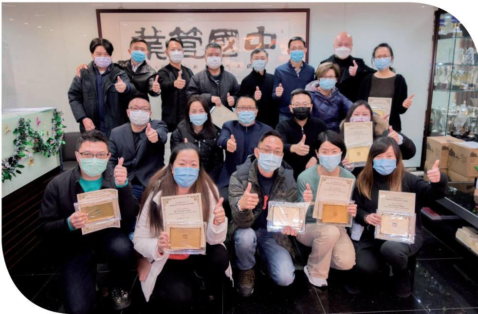
Present employees long-term service awards 頒發員工長期服務獎

我們會每年為員工進行一次評估，並定期按照員工表現、市場薪酬趨勢、通貨膨脹等因素檢討薪酬策略，以確保向員工提供具市場競爭力的薪酬。本集團設有一項購股權計劃，向本集團合資格董事及僱員提供獎勵及報酬。本集團亦設有長期服務獎，對連續服務每滿10年的員工發放獎勵，以表揚其長年忠誠服務和貢獻。